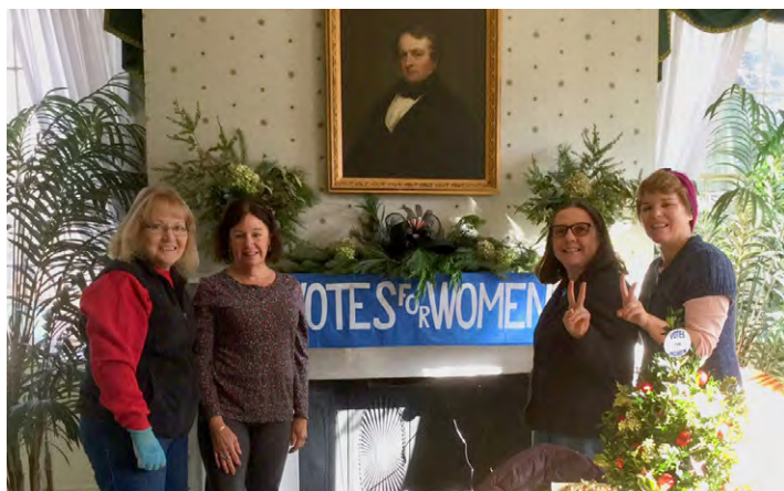
Members decorate the Martin Van Buren Historic Site for the holidays with an interpretation of the 1916 Votes for Women theme.