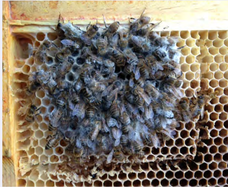
The winter bee cluster.

So you can appreciate the amazing life of the honey bee that gives us the liquid gold we all love.