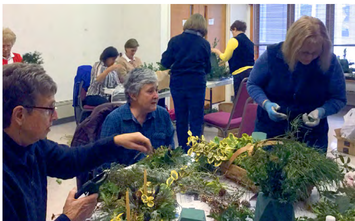
Members gather to create holiday decorations at our Boxwood workshop.