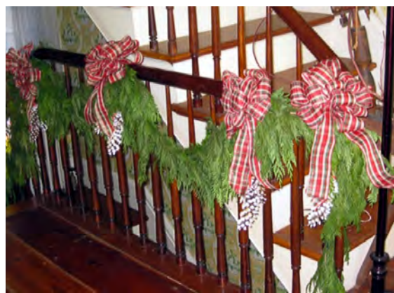
Top: Just a sample of some of the 40 arrangements that were made by Club members for sale at the Open House.