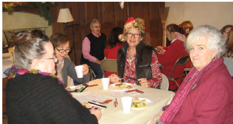
Club members having a good time at our Annual Holiday Luncheon.