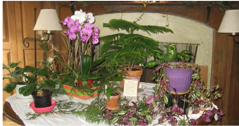
Our Holiday Open House featured an educational exhibit on house plants that would make great gifts for the holidays.

The Germantown Garden Club yearbook committee met to plan the club’s programs and activities for 2017. Each year the club uses a theme upon which to focus some of their monthly speaker presentations. The theme for 2017 is “ Creating Special Gardens .” Included this year will be an overview of the many different theme gardens that can be planted. Included in the program this year will be, to name a couple, a bulb garden, and a fairy garden. The club will meet and tour the home of a member who has an orchard of more than 500 apple trees of multiple varieties. Also on the agenda is The Germantown Garden Club’s annual award-winning flower show to be held in June. A field trip is also planned to the home of a professional gardener who will demonstrate the ‘art’ of pruning. 2017 is shaping up to be another exciting year for the gardeners of the Germantown Garden Club. The first meeting of the new year will be February 28 at noon in the Hover Room at the Germantown Library.