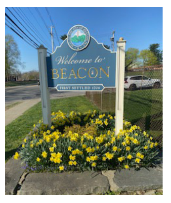
Top: Hanging baskets along Main Street. Bottom: Route 52 entrance to Beacon. Far left: Planting the raised bed planters along Main Street.