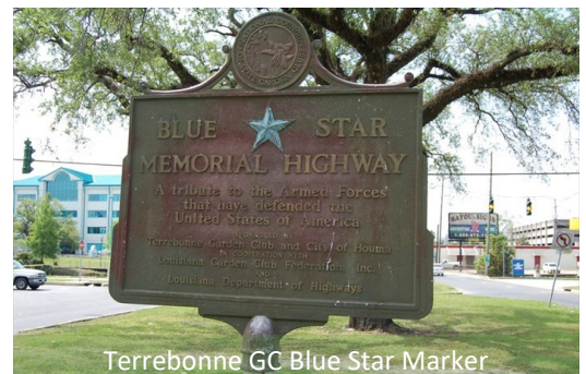
Terrebonne GC Blue Star Marker