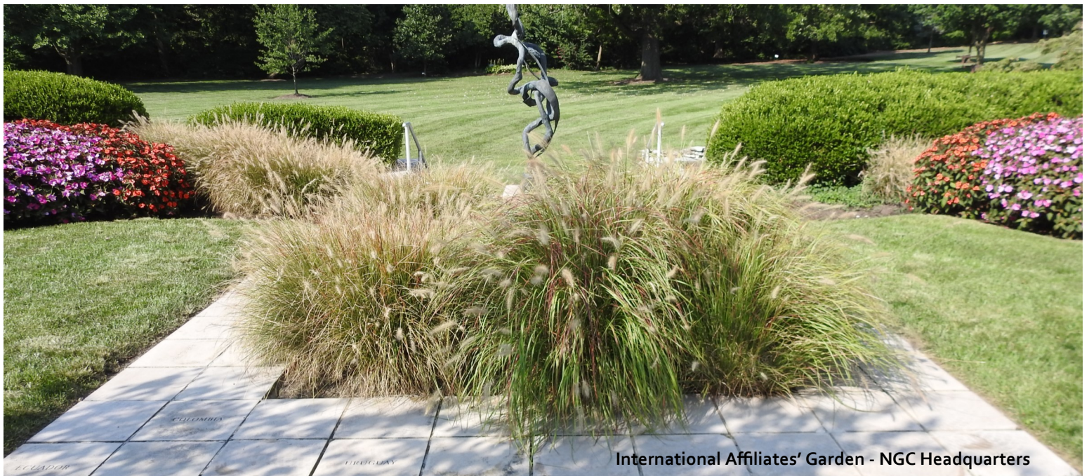
International Affiliates’ Garden - NGC Headquarters