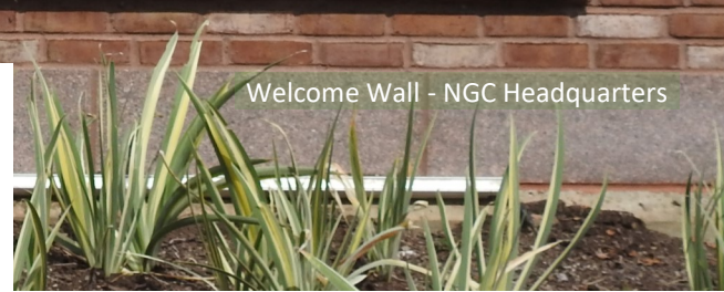
Welcome Wall - NGC Headquarters