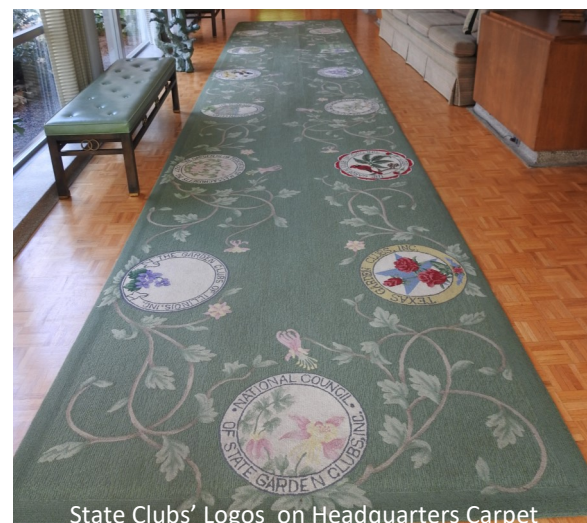
State Clubs' Logos on Headquarters Carpet

Editor's Note: Thank you to all of our dedicated NGC staff for taking time out of their very busy days to share a bit of themselves with all of you. They are a great source of help and information and we are so very lucky to have their support.