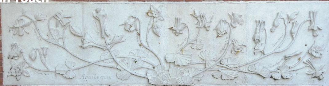
Wall Sculpture of Columbine Species From Every State