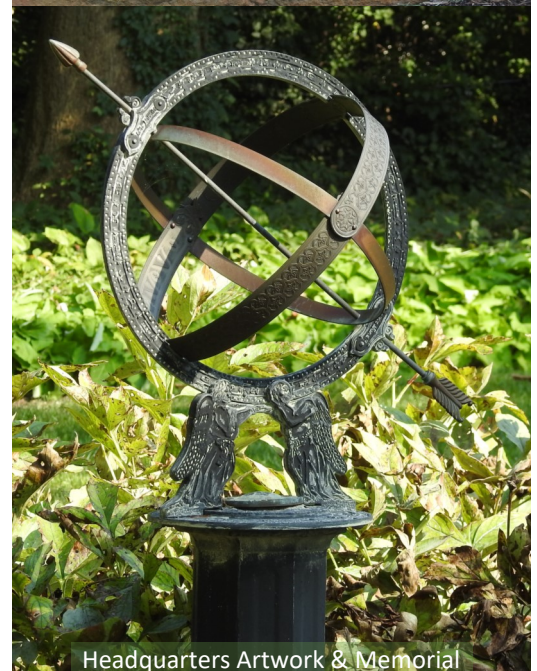
Headquarters Artwork & Memorial