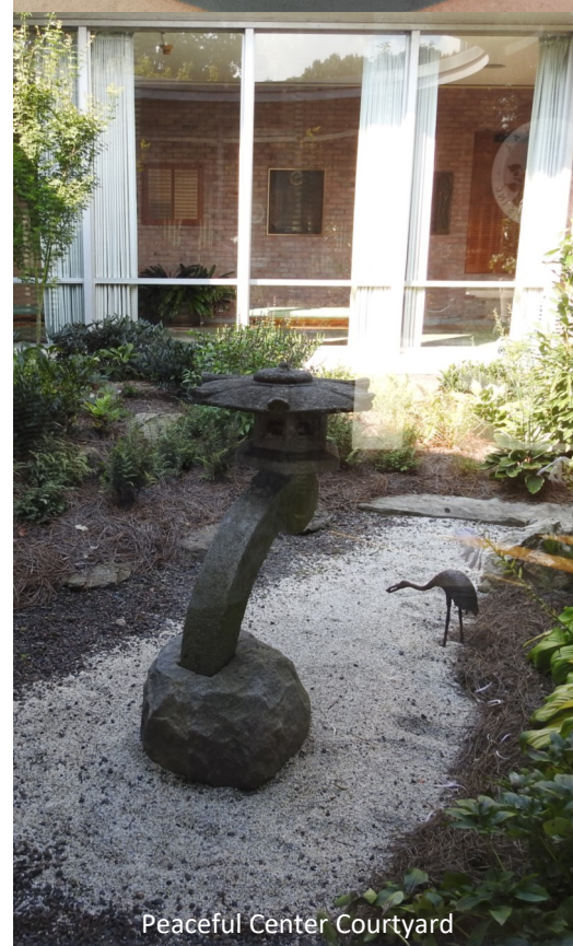
Peaceful Center Courtyard