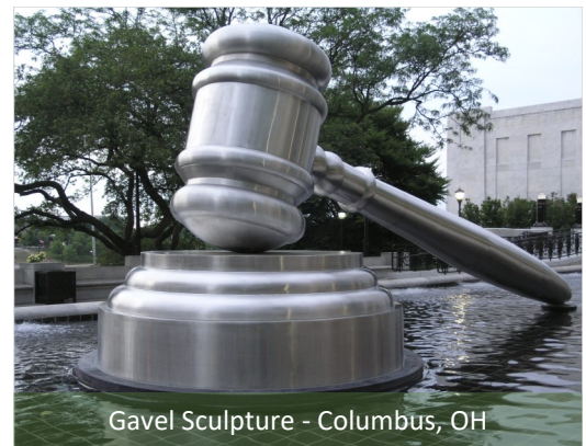
Gavel Sculpture - Columbus, OH