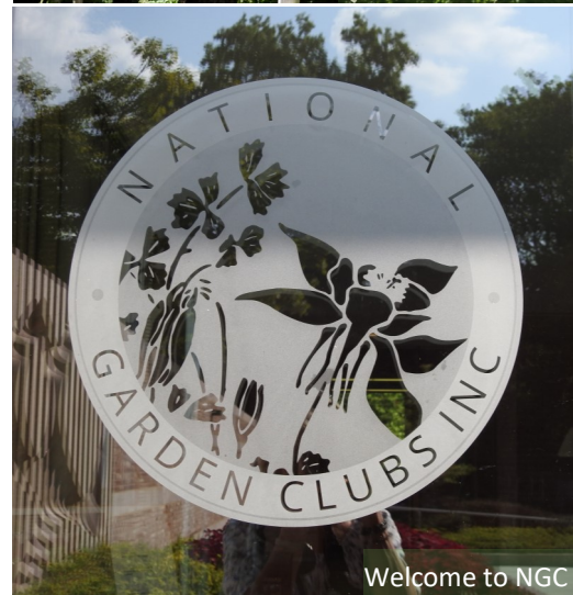
Welcome to NGC