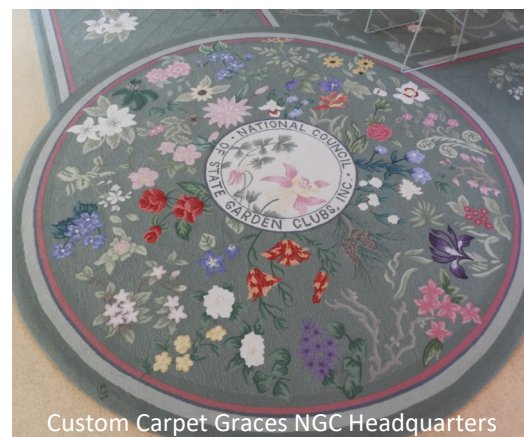
Custom Carpet Graces NGC Headquarters