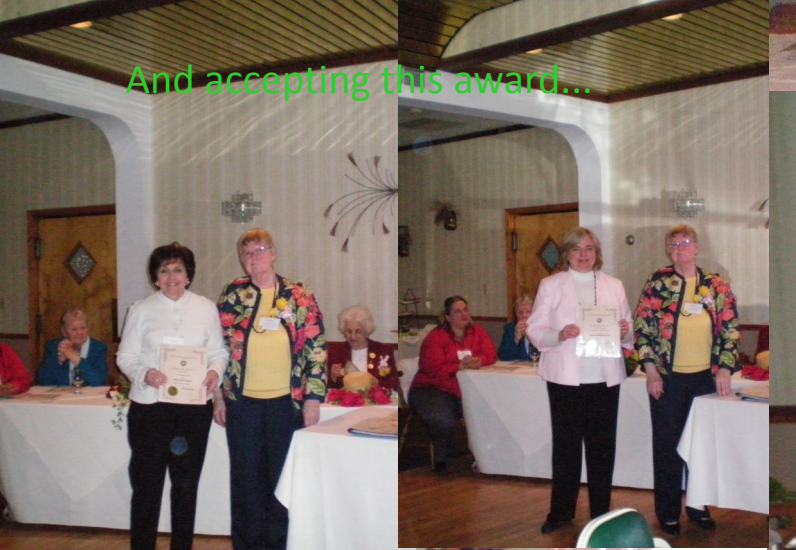
And accepting this award...