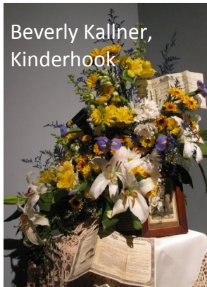
Beverly Kallner, Kinderhook