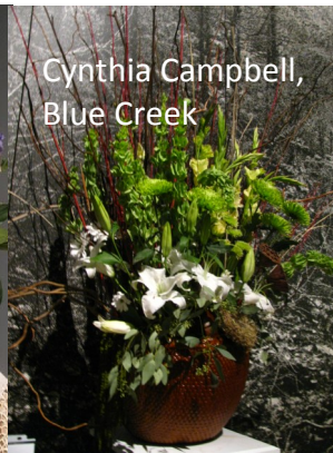
Cynthia Campbell, Blue Creek