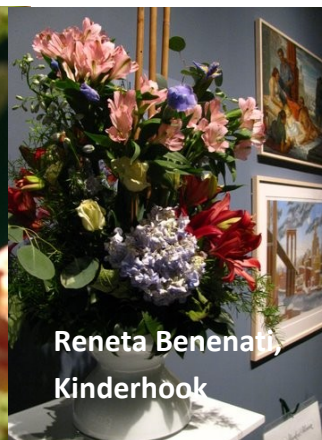
Reneta Benenau, Kinderhook