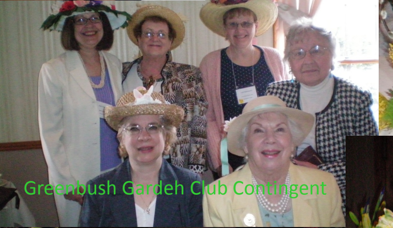
Greenbush Garden Club Contingent