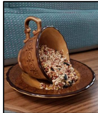
Tea with the birds