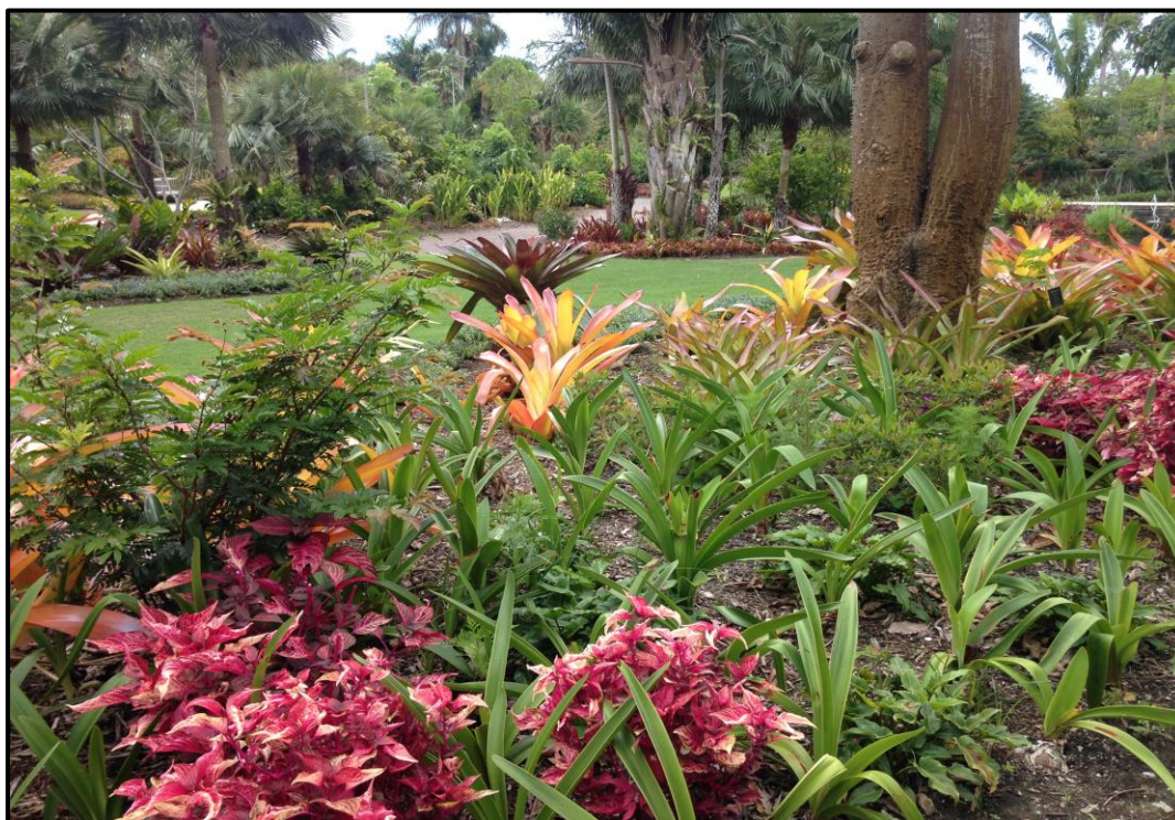
Naples Botanical Garden, Naples, Florida