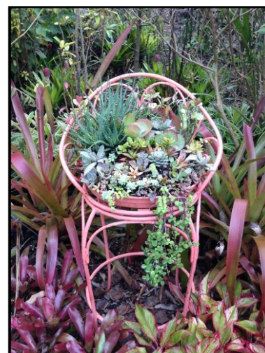
Naples Botanical Garden, Naples, Florida

PLEASE consult our website for the latest information on schools and refreshers: www.gardenclub.org