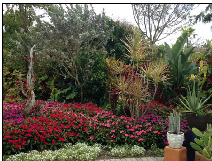
Naples Botanical Garden, Naples, Florida