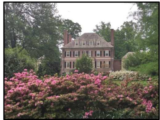
The back of the Sherwood House overlooks the Gardens