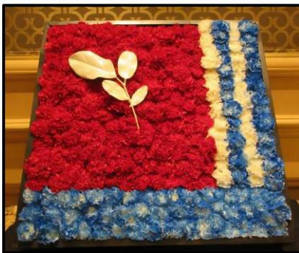
Tribute Design at NGC Convention in Biloxi

As I write this in mid-August, I was concerned a few days ago that there should be more Landscape Design School Courses on the calendar. Then we received four registrations all at once. I'm hoping that as states and districts and clubs are ending summer breaks and getting back to the activities of garden club that they will consider the value and benefit of including plans for a Landscape Design School on the calendar for the new garden club season.