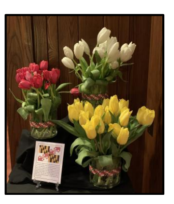
Maryland - Tulip