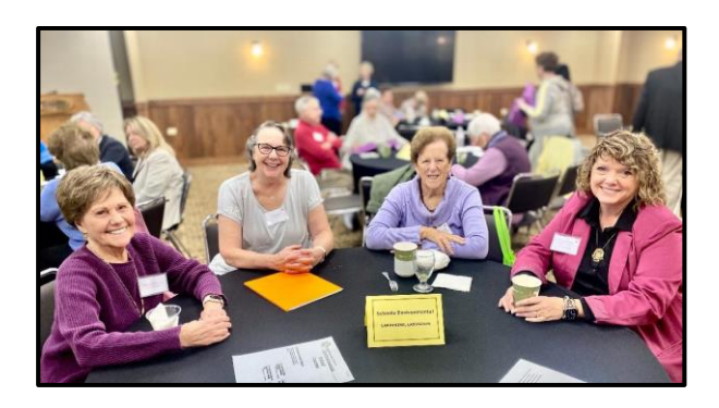
Schools Environmental, Gardening, Landscape