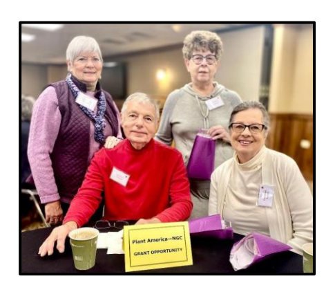
Plant America – NGC Grant Opportunity