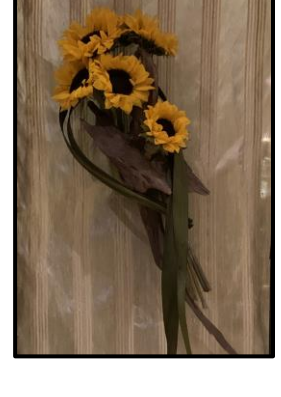
Sunflower - New York