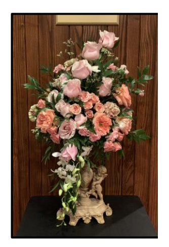
Delaware - Rose