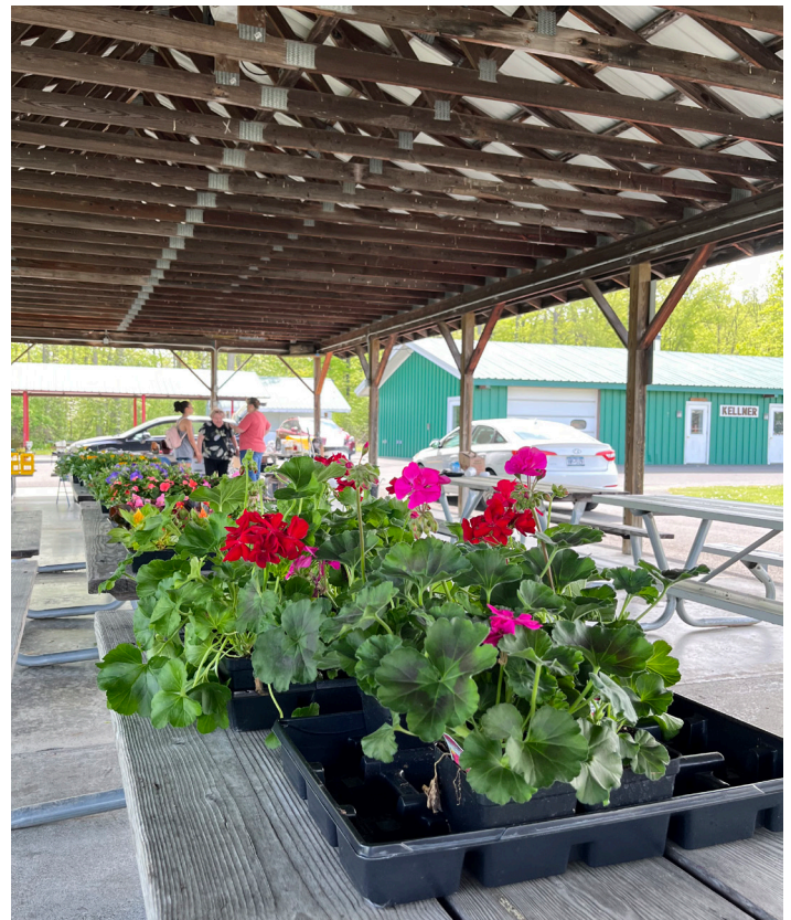
We held our Annual Plant Sale on May 14 at the Palatine Park Pavillion. There were annuals, perennials, herbs, vegetables, and houseplants on offer. Some of the plants were donated by members. The others came from a local nursery.