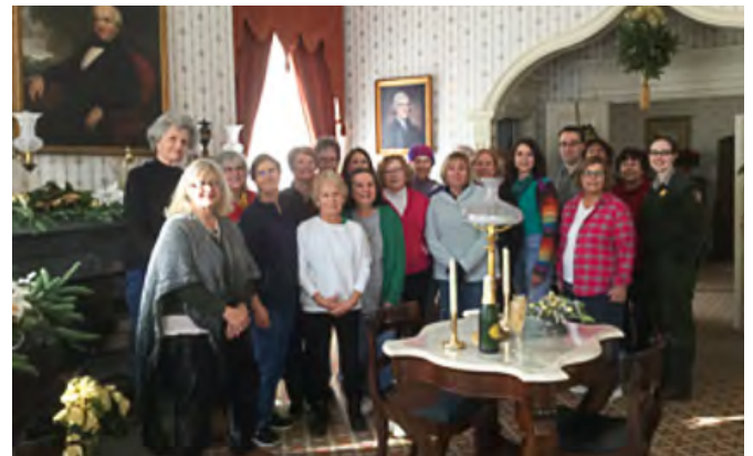
Members decorate the house of President Martin Van Buren for the holidays at Lindenwald.