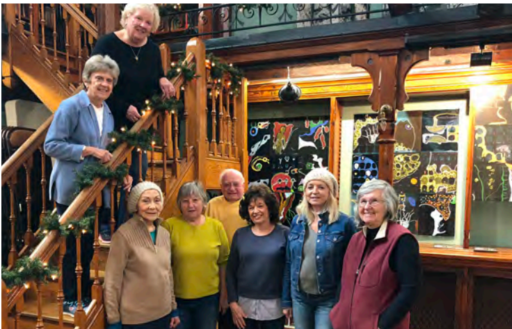
Left: Members take time out for a photo op after installing Christmas decorations at the Howland Cultural Center, home of the Tioronda Garden Club.