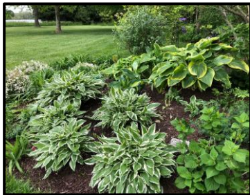
Spring green and white....Hosta and Deutzia ...with a "baby" hydrangea, astilbe, White geranium (not in bloom), and day lilies that will bloom in the summer...

Summer time.... Hosta, Heuchera , Carex, Coleus all under Viburnum carlesii bordering our pool