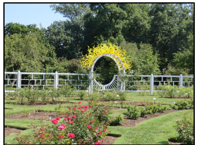
Chihuly Glass Sculpture at Missouri Botanical Garden, St. Louis, MO