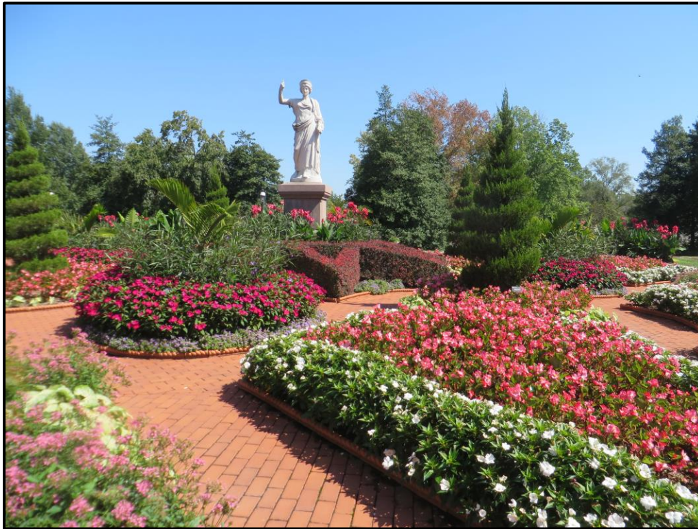
Missouri Botanical Garden, St. Louis, Missouri

All submissions must be original material. Photos are welcome! Please send articles in Word format and photos to the Editor at CSCarbaugh@verizon.net .