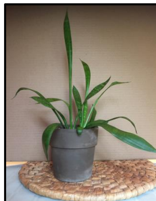
Dwarf Sansevieria 'Snake Plant'

E. CONTAINER-GROWN DWARF PLANTS Containers are great for a petite single plant or a landscape and do very well if you place them where you can monitor the light, food and water! Pictured herein is a dwarf Sansevieria – a petite given to me about 15 years ago. It took almost half of that time to grow much and for the leaves to harden like the standard. It was no more than 2" high and the leavers were plain green, soft and pliable. Now it is a beautiful almost 12" high, with strong horizontal with leaves that have a darker and wavy horizontal line, and has new plants forming.