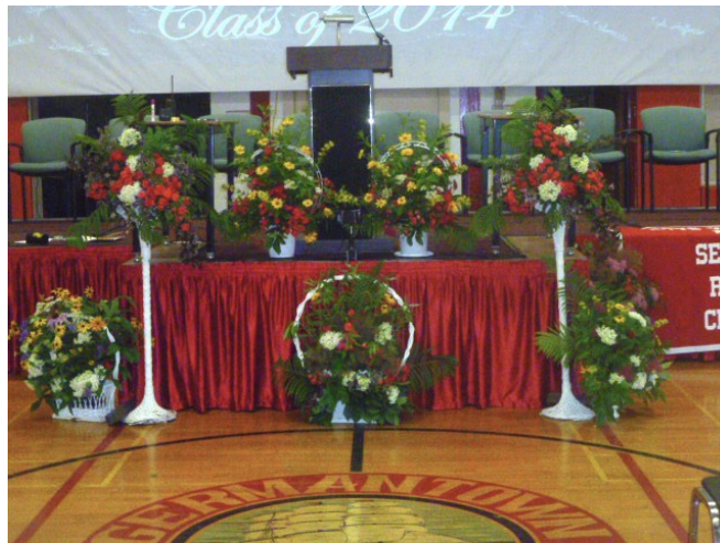
Germantown Garden Club arrangements for Germantown High School Graduation.