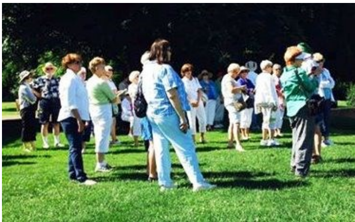
A visit to Blithewood Manor Garden at Bard College.